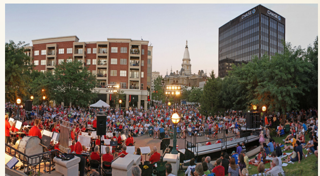
Reihle Plaza located across the street from Renaissance Place host dozens of events each year that attract thousands of participants